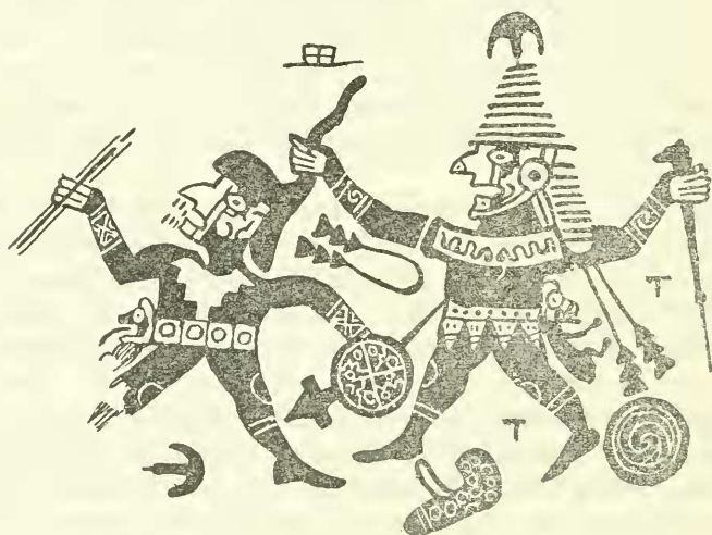
FIG. 1.—BATTLE SCENE SHOWING USE OF SLING.

rounding regions. 1 To the south, in the valleys of Huarea, Chilca, Mala, and Runahuanac, the chief power was in the hands of a personage called Chuquimancu. The region around Chinchá Alta and Chinchá Baja was ruled by a chief, named Chinchá. Garcilasso tells us that before the Inca conquest the subjects of the chief called Chinchá had been very powerful; that they had come from far away and that they were warlike. 2 Finally, the districts about and between Pisco, Ica, and Nasca seem to have been closely allied, after the manner of the groups of valleys further north. 3 All these coast regions were the seat of high culture for some time, in places perhaps for several centuries, before the Inca clan in the Cuzco Valley began its extraordinary climb to imperial power. The Inca domi-